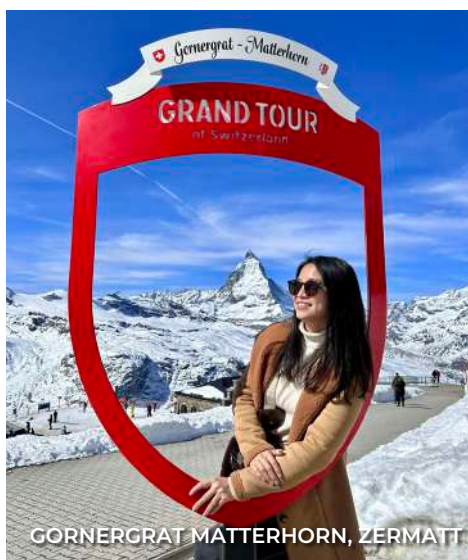
GORNERGRAT MATTERHORN, ZERMATT

Begin your day in the charming village of Zermatt , and embark on a cog railway to the Gornergrat . The ride alone offers countless picture postcard scenes such as chalets typical of the Valais, and a stunning mountain panorama. Upon reaching the summit at 3089m, indulge in the spectacle of iconic peaks such as the Matterhorn and Monte Rosa . Descend to Riffelberg , and alight to see the famous Riffelsee Lake where the famous Matterhorn is reflected in calm waters. Visit the Matterhorn Museum for insights into Zermatt's history before enjoying free time to explore the village at your leisure.