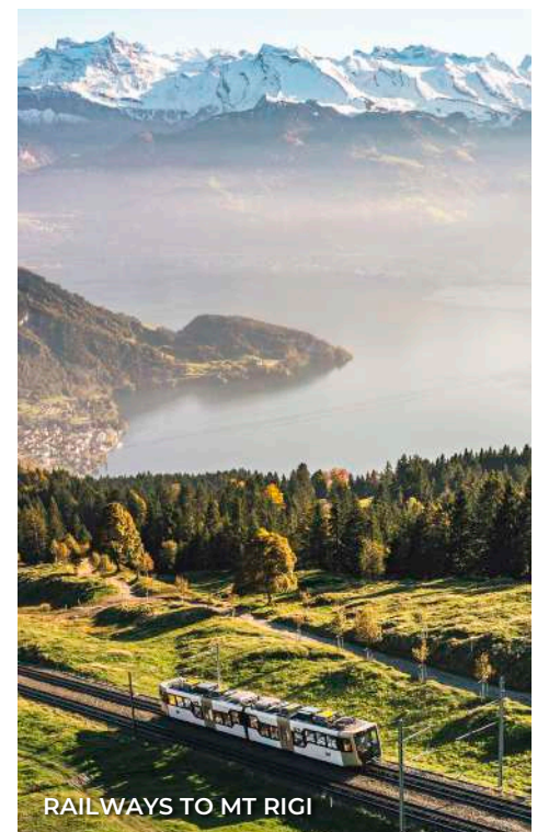
RAILWAYS TO MT RIGI