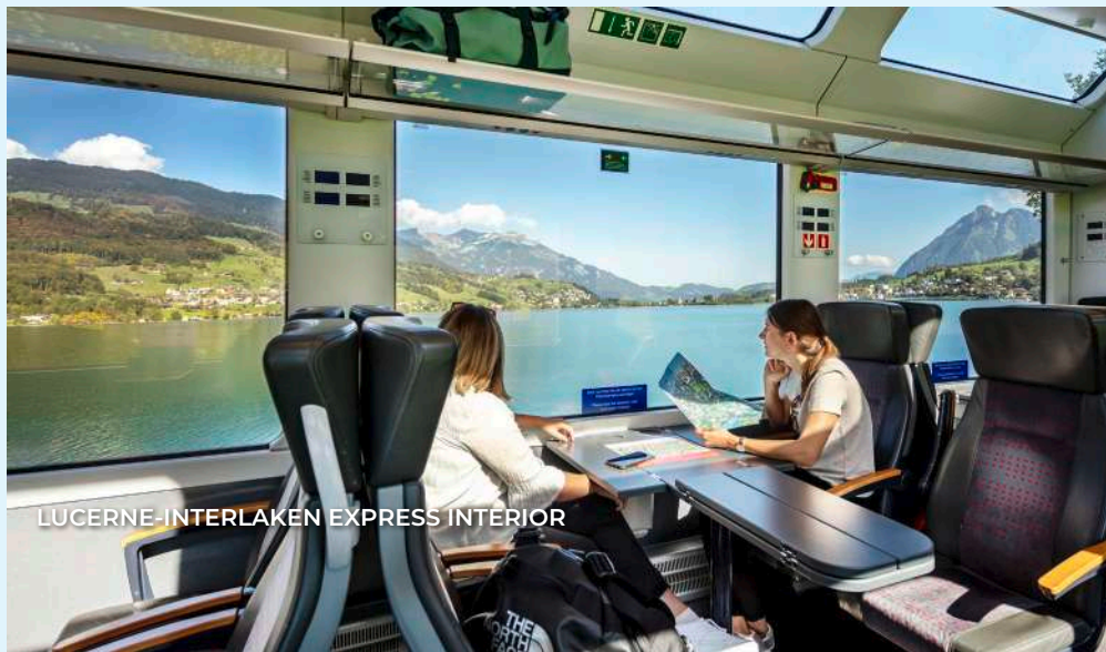
LUCERNE-INTERLAKEN EXPRESS INTERIOR

*Note: Hotels subject to final confirmation. Should there be changes, customers will be offered accommodation similar to this list.