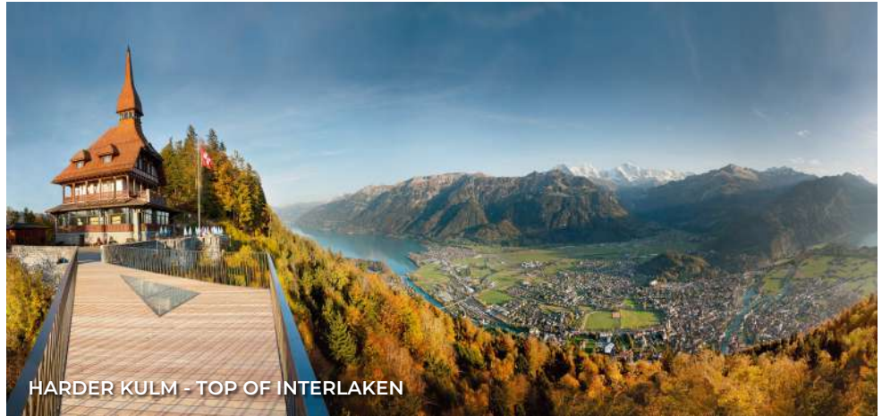
HARDER KULM - TOP OF INTERLAKEN

Breakfast, Dinner – Swiss Fondue + Wine Embark on the Luzern – Interlaken Express , admire the stunning mountain scenery, serene lakes, and cascading waterfalls. Visit to the Ballenberg Open-Air Museum , covering 66 hectares with over 100 original buildings showcasing Swiss